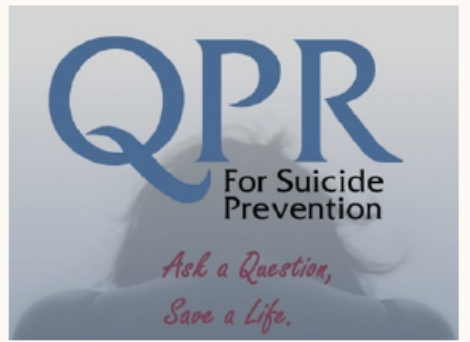
*For ages 10 and older

Learn more about how you can help save a life.